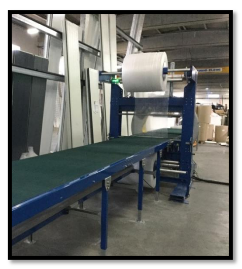
* Mod. with conveyor belts (optional) automatic top presses (optional) and automatic bubble wrap dispenser (optional).